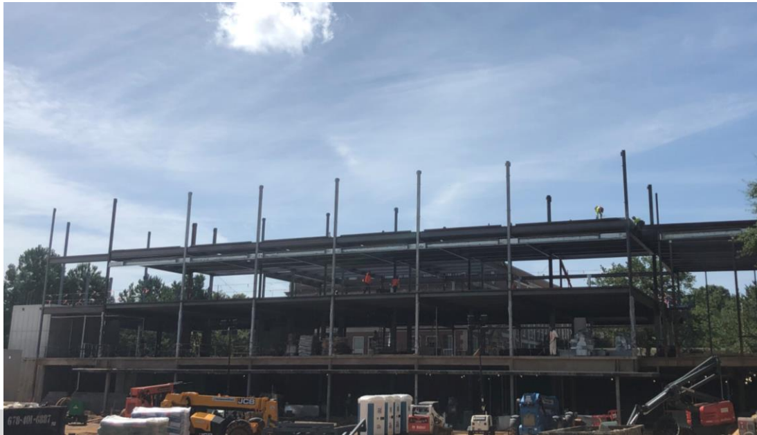
New Addition Progress