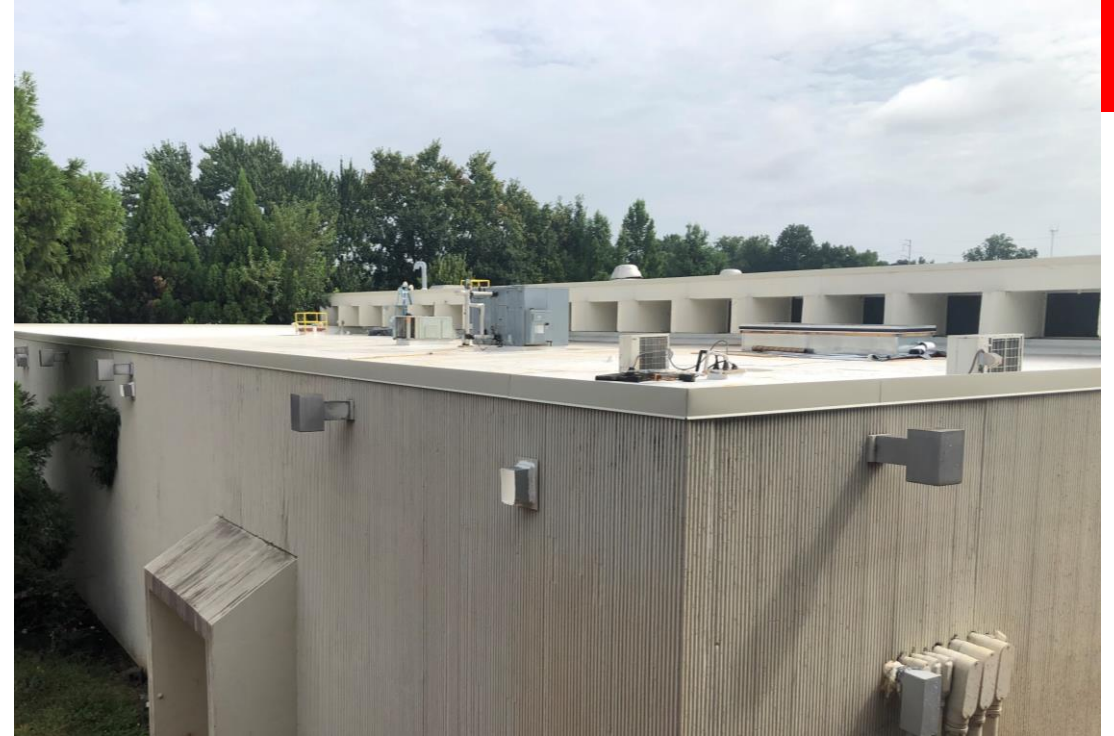
Metal Coping installed at Performance Gym Roof