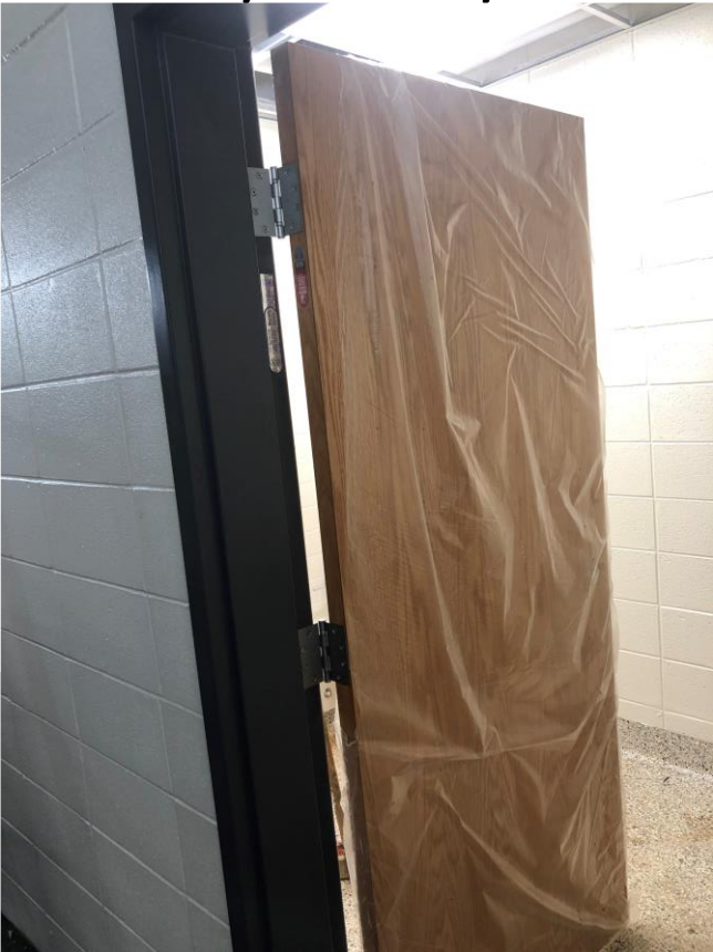
Door and Hardware installed in Performance Gym Lobby