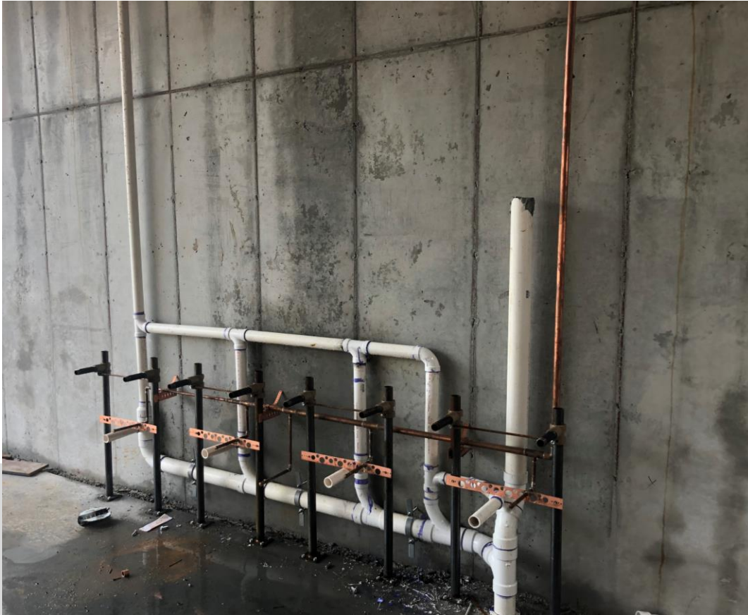
Plumbing Roughed in at 2 nd Floor Restroom