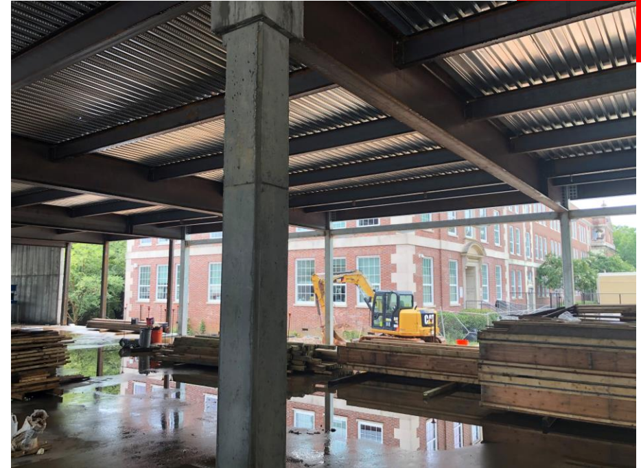
Second floor interior columns complete