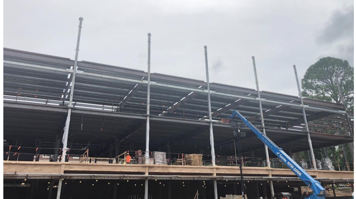
New Addition Progress