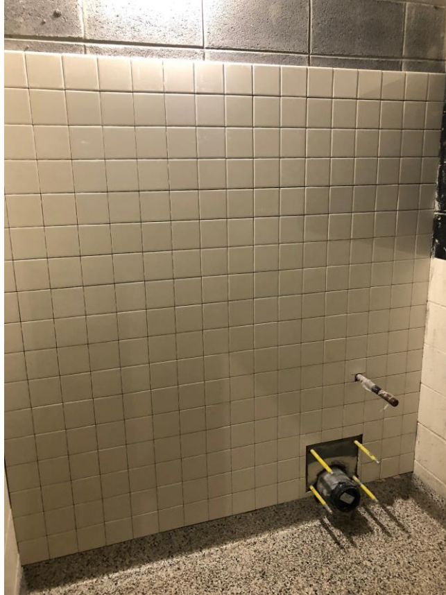
Ceramic Tile installed in Performance Gym Lobby